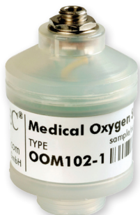
Oxygen Sensor: OOM102-1

Oxygen (O 2 ) Gas Sensor Honeywell EnviteC Series